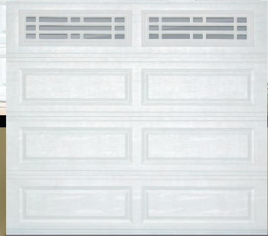
8' x 7' 4240 white with optional mission window inserts