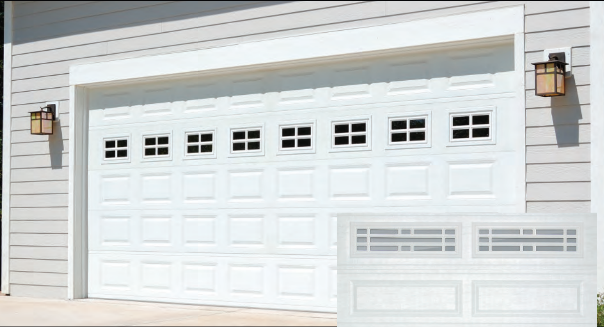
Pictured. 18' x 8' 2241 white with optional stockton window inserts