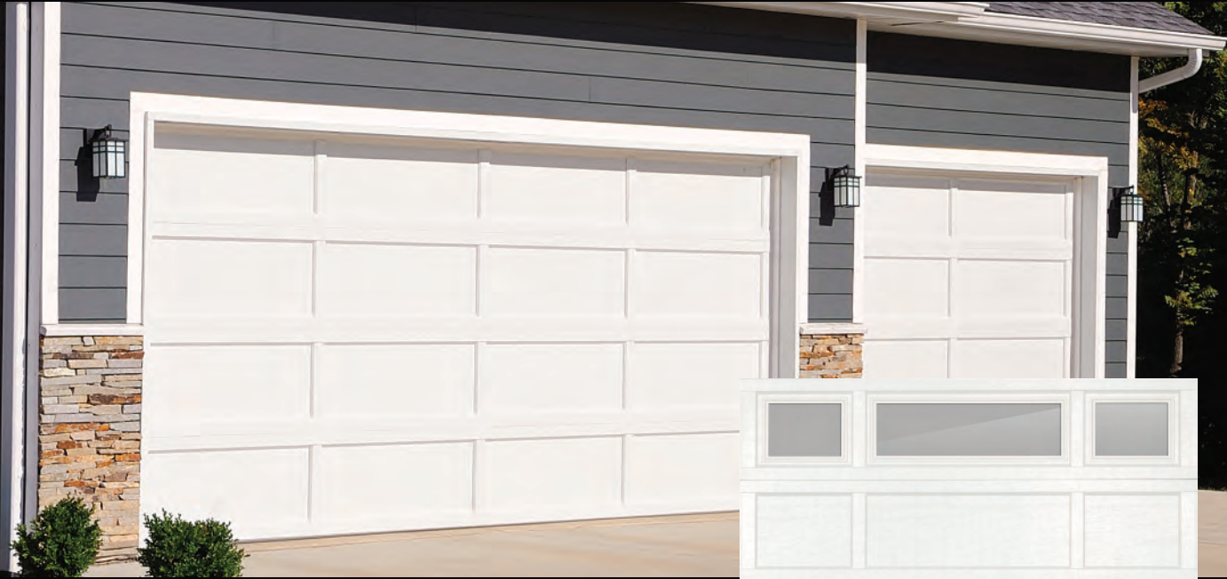
Pictured. 16' x 8' 2294 white door; 9' x 8' 2294 white door