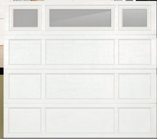
8' x 7' 2296 white with optional plain glass